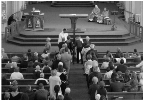
Veneration of the Cross